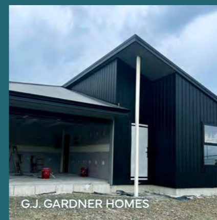
G.J. GARDNER HOMES

There's a number of new homes underway in Mangawhai Central. At varying stages from framing to interior painting, we're excited to welcome new neighbours soon.