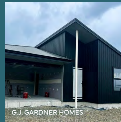
G.J. GARDNER HOMES

There's a number of new homes underway in Mangawhai Central. At varying stages from framing to interior painting, we're excited to welcome new neighbours soon.